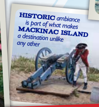
HISTORIC ambience is part of what makes MACKINAC ISLAND a destination unlike any other