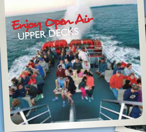
Enjoy Open Air UPPER DECKS