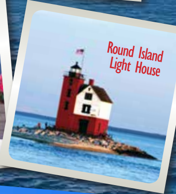
Round Island Light House

Star Line Welcomes Dogs Along for the Ride! (as long as it is on a leash and under control)