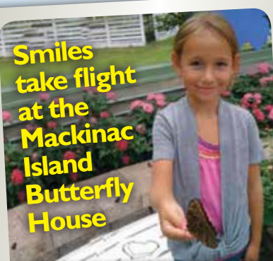
Smiles take flight at the Mackinac Island Butterfly House